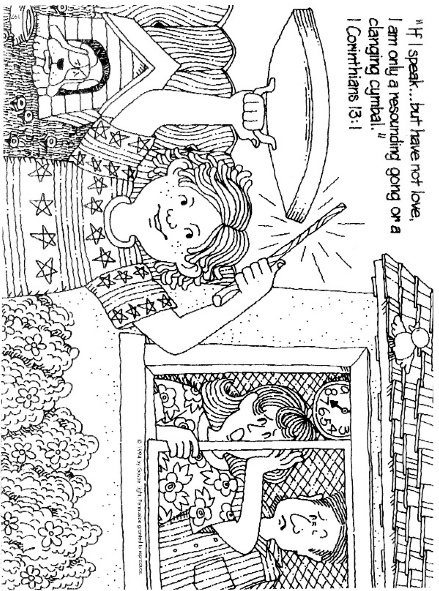
© 1994 by Goose Light. Permission granted to reproduce.

"If I speak...but have not love, I am only a resounding gong or a clanging cymbal." 1 Corinthians 13:1